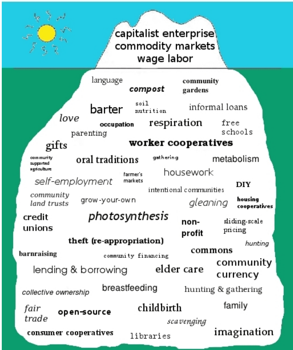
Figure 1. The Diverse Economy Iceberg. Source: communityeconomies.org/key-ideas .

ultimately such a deconstructive process “explodes the binary, yielding a queer or radically heterogenous landscape of economy and a new ground for pluralistic