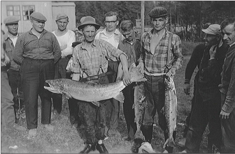
Figure 2. Fishermen in Taivalkoski, Iijoki.

well as the features of the river at the fishing ground. The current and depth of water, and the river bed of the fishing ground, determined which type of trap was used. Different methods were used in rapids and in quiet waters.