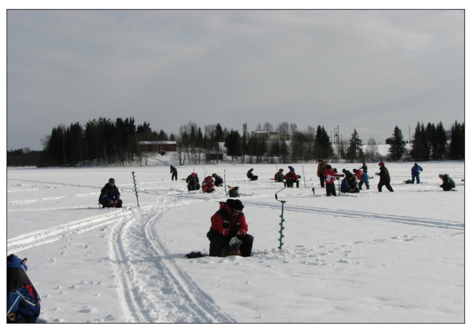
Figure 2. Having, loving, being: Ice-fishing village event in Salla, northern Finland.

part of the world in motion, are affected by global flows and witness the ways in which 'the global' works in a local context.